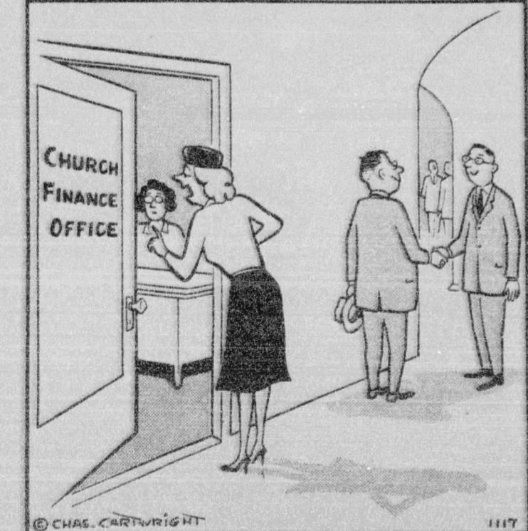
"Don't send my husband too many pledge reminders. If they stack up too high, he changes churches!"