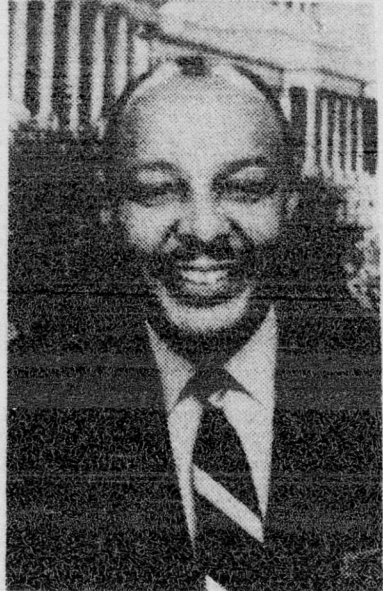
CONG. LOUIS STOKES

Shaw University's Founder's Day activities will be something special this year. The annual activities of the 106-year-old predominately Black liberal arts institution will take on a new look when the Baptist-affiliated institution of higher education will award Honorary Doctor of Laws degrees to nine outstanding Black political figures, who will also receive appointments as adjunct professors to Shaw University's new Center for Political Studies.