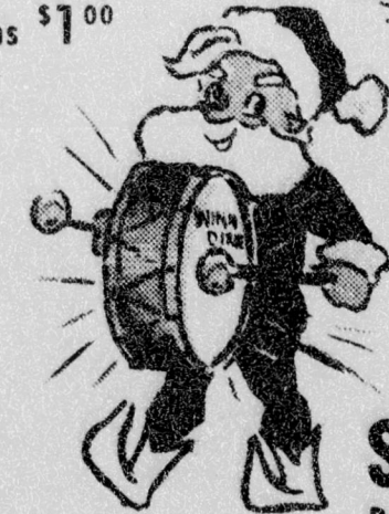
Bonus Pack HANDI WRAP

Astor Full-O-Fruit COCKTAIL Limit 5 with $5 or more food order. 5 1-Lb. Cans $1.00