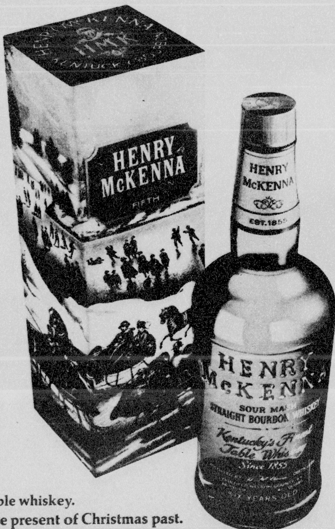
Table whiskey. The present of Christmas past.

Raleigh Memorial Auditorium December 26, 1971 Two Showings- 2:00 pm and 6:00 pm. Admission- $2.00 Sponsored by Drug Action of Wake County, Inc. and Africana, Inc. FOR TICKETS: AT DOOR OR CALL 833-1161 GO BY: AFRICANA ARTS CENTER, INC., OLD UNITED CHURCH BUILDING HILLSBOROUGH & DAWSON STREETS