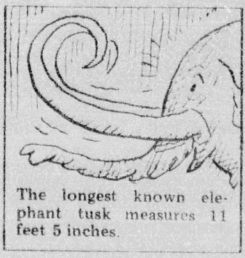
The longest known elephant tusk measures 11 feet 5 inches.

My heart is sore pained within me and the terrors of death are fallen upon me.