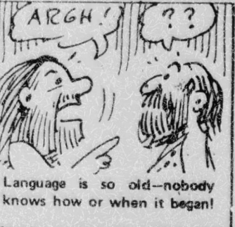
Language is so old-nobody knows how or when it began!

way open. You have just finished reading the report on the bullet taken from Grant's brain verifying that it had been shot from the gun found by Sergeant Kelley. Your eyes now travel over to the late edition of the newspaper lying on the edge of your desk and bearing the headlines: "GEORGE GRANT COMMITS SUICIDE." You shake your head and mutter to yourself, "This was no suicide. Grant was murdered!" What leads you to this conclusion? SOLUTION Since the bullet was found in the victim's brain, it caused instantaneous death. However, since the death weapon was found on the papers INSIDE the safe and since Grant's feet were IN FRONT of the safe, he could not have fired the fatal shot. Had he done so, the gun would not have been inside the safe.