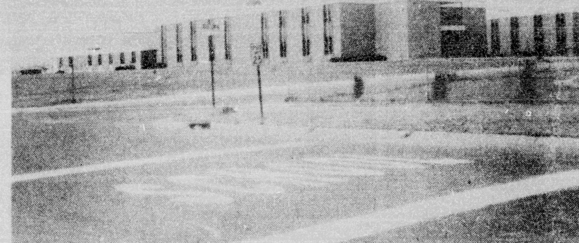
NEW DILLARD HIGH SCHOOL - Pictured here is the new Dillard High School in Goldsboro, standing in all of its splendor. The old school, located in a completely black neighborhood, is now situated some distance from its former location. The old school was gutted by fire.