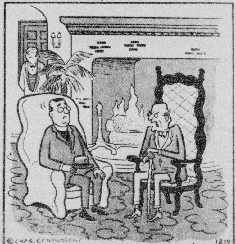
"On the other hand, if I CAN'T figure out some way to take it with me . . .!"