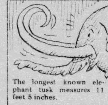
The longest known elephant tusk measures 11 feet 5 inches.