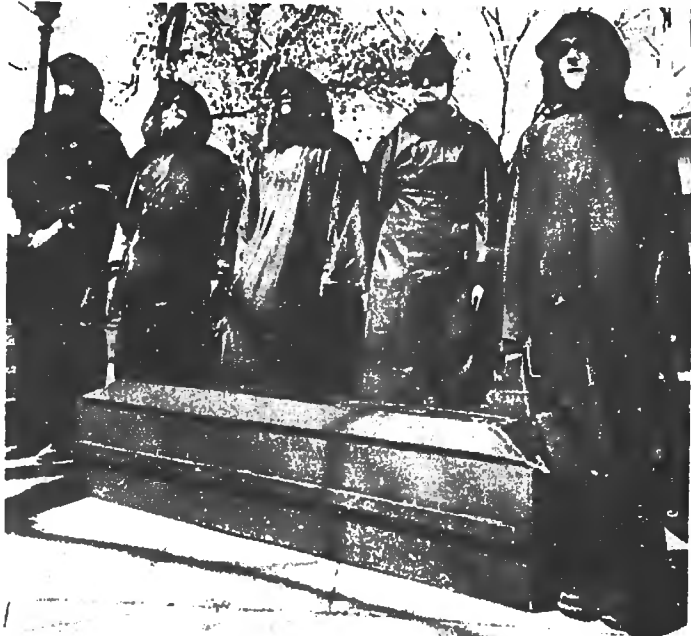
"SYMBOLS OF LIFE AND DEATH"—Harrisburg, Pa.: Costumed as "Symbols of Life and Death" supporters of the "Harrisburg 7" stand before a coffin on Capitol Plaza during the 1st of 6-rallies held through the Easter Week.