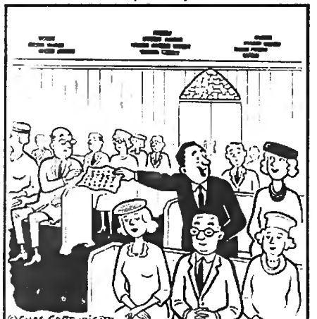
"You've got to admit they economize. They made only one copy of the budget, in crayola on wrapping paper!"

The Church is God's appointed agency in this world for spreading the knowledge of His love for man and of His demand for man to respond to that love by loving his neighbor. Without this grounding in the love of God, no government or society or way of life will long persevere and the freedoms which we hold so dear will inevitably perish. Therefore, even from a selfish point of view, one should support the Church for the sake of the welfare of himself and his family. Beyond that, however, every person should uphold and participate in the Church because it tells the truth about man's life, death and destiny; the truth which alone will set him free to live as a child of God.