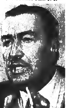
DR. ADAM C. POWELL, JR. Appreciation Money Won

Powell, a minister who was expelled from Congress in 1967 for misuse of public funds, died in Jackson Memorial Hospital, Powell had been in a coma since he was flown here by Coast Guard helicopter from his home in the Bahamas on March 17. A hospital spokesman said he died peacefully at 10:45 p.m. EST. (See POWELL, DIES, P. 2)