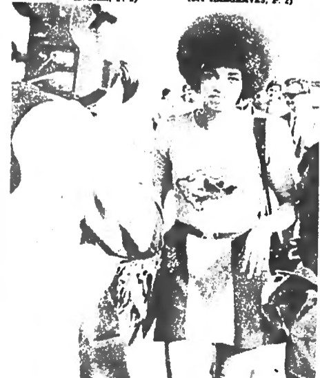
ANGELA SHOWS OFF "HER NEW LOOK" - SAN JOSE, CALIF.: Angela Davis showed up at her trial April 3rd wearing a new outfit, a mini-skirt knit dress with a dove emblazoned on her blouse. A photographer, who took pictures of the 1970 Martin County shootings, was on the stand for the prosecution and also a Martin County Sheriff's captain.

NEW YORK, N. Y. - Racist governments in Southern Africa and the support they receive from the United States and other world powers were condemned by Dr. Ralph David Abernathy, president of the Southern Christian Leadership Conference, at a meeting of the United Nations Commission on Racism and Apartheid. The meeting took place at the U. N. headquarters here.