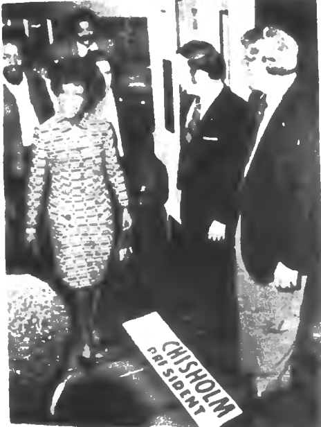
GETS PROTECTION-San Francisco: Rep. Shirley Chisholm (D-New York), arrives at San Francisco International Airport May 15 and is flanked at right by Secret Service agents. Mrs. Chisholm called the shooting of Gov. George Wallace "a very sad day for this country." She said she accepted President Nixon's offer of Secret Service protection after the shooting of Gov. Wallace because "I have to consider my staff and family."