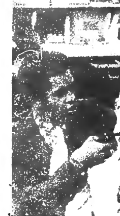
BANK ROBBERY IN PROGRESS - Boston: Cameras in two different positions in the Elliot Savings Bank in the Roxbury section of Boston showed this robbery in progress last week by a black male about 6 ft. tall, slim build. Upon approaching the bank president, he pressed a gun to his back and took $5,540 in cash from several tellers. He then kidnapped the bank president, forcing him to drive him in his car and make good his escape by abandoning the car and the president at the Mount Pleasant section.