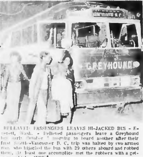
RELEASED PASSENGERS LEAVES HI-JACKED BUS - Everett, Wash. - Released passengers leave a Greyhound bus early October 7 morning to board another after their first Seattle-Vancouver B. C. trip was halted by two armed men who hijacked the bus with 29 others aboard and robbed them. At least one accomplice met the robbers with a getaway vehicle.