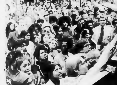
"PEOPLE ARE FED UP" - Kennedy - Keystone, W. Va. - Sen. Edward M. (Ted) Kennedy, D-Mass., told some 400 persons at Keystone in McDowell County "people are fed up with government that can't perform." Sen. Kennedy campaigned in West Virginia Saturday on behalf of the McGovern-Shriver ticket and Democratic gubernatorial hopeful John D. Rockefeller IV.