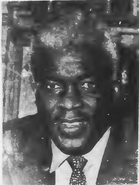
JACK ROOSEVELT ROBINSON