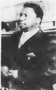
INVOLVED IN HOTEL ROOM