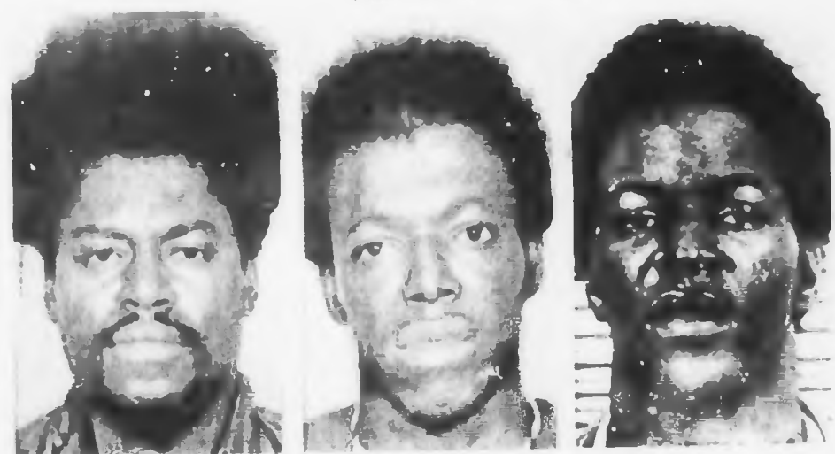
THREE HIJACKERS ARE IN CUBA PRISON FOR LIFE - Miami - The Federal government charged November 12 three young black fugitives still in Havana with air piracy in the hijacking of a Southern Airways jet and recommended bond of $1 million for each.