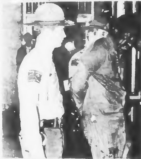
M. C. BANK ROBBERY SUSPECT - Greensboro, N.C. - Two N. C. State Highway Patrolmen escort one of two suspected bank robbers to the FBI office at the Federal Building here. Captured after a long chase on I-85 and I-40, he had not been identified by midnight November 14.