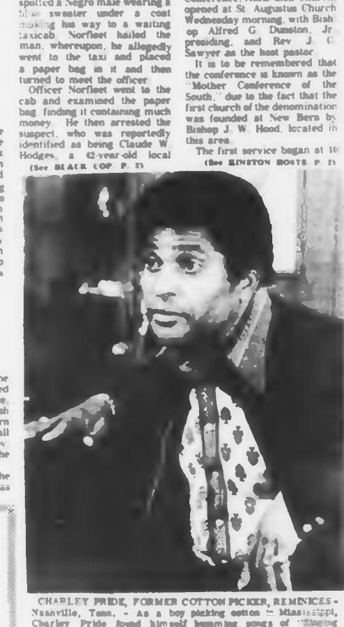
CHARLEY PRIDE, FORMER COTTON PICKER, REMINISCES - Nashville, Tenn. - As a boy picking cotton in Mississippi, Charley Pride found himself humming songs of "Stagger Brakeman" Jimmy Rodgers instead of wailing the gut bucket blues. Those days, however, that boy who was to imitate the likes of Rodgers and Roy Acuff is packing city audiences from coast to coast with predominantly white audiences. Last year the Country Music Association voted him "Entertainer of the Year."