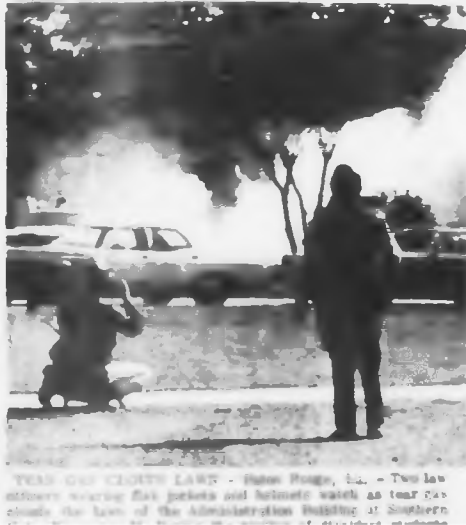
TEAR GAS CLOUDS LAWN - Baton Rouge, La. - Two law officers wearing flak jackets and helmets watch as tear gas clouds the lawn of the Administration Building at Southern Univ. November 16. During the routing of dissident students from the building two black students were killed. According to a coroner's report, one died of shotgun wounds. The cause of death of the second Southern student has not been announced.