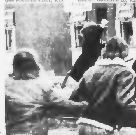
IN-RACIAL FIGHT FUE - Chicago - Two youths in "foreground square off as another chase a fourth during a fight between whites and blacks at Chicago's Gage Park High School November 16. At least 22 persons were arrested during the second day of violence at the troubled school. Two students were injured. The school was closed early in the afternoon and will resume classes on November 21.