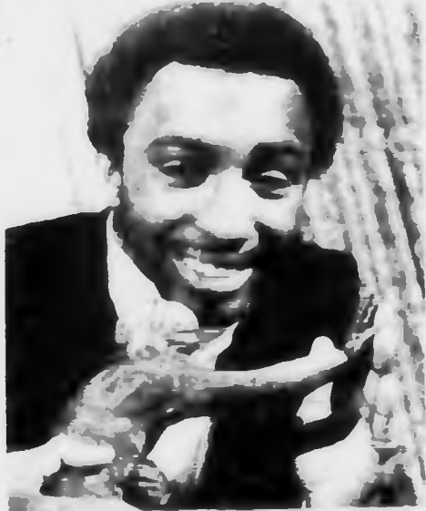
JOHNNY RODGERS WINS COVETED HEISMAN TROPHY — New York. Johnny Rodgers, Nebraska's triple threat runner, holds the Heisman Trophy awarded to him Dec. 5. Rodgers is a native of Omaha, Neb. His selection was in doubt because of a marijuana charge.