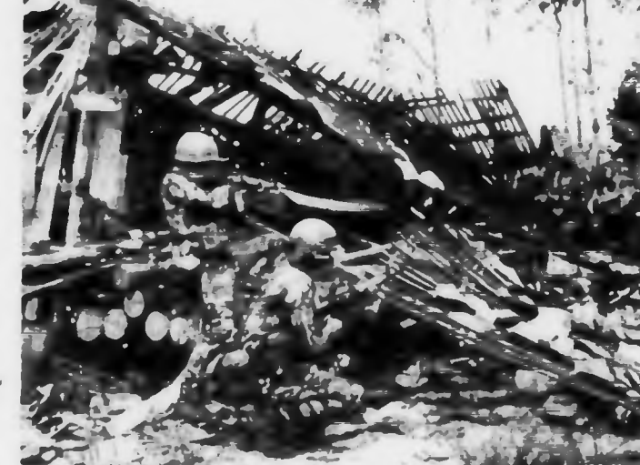
WAR SCENE — HOW MUCH LONGER? Ben The, South Vietnam — South Vietnam paratroopers aim their weapons at a bush where they suspect an enemy may be lurking near this destroyed home in Ben The during a recent search and destroy mission. Ben The is located about 20 miles north of Saigon.

STOKELY 'UNDESIRABLE ALIEN' — Montreal Black militant Stokely Carmichael was refused admittance to Canada December 5 and was returned to the U.S. after a lengthy Immigration Dept. hearing. He had been invited to Canada to appear on a TV program but was declared an "undesirable alien."