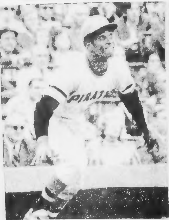
CLEMENTE IN ACTION - San Juan, P.R. - Pittsburgh Pirates' Roberto Clemente grins (L.) as he watches ball take off for a home run blast during sixth game of World Series against Baltimore Orioles in October 16, 1971 photo. At right, Mets' Willie Mays