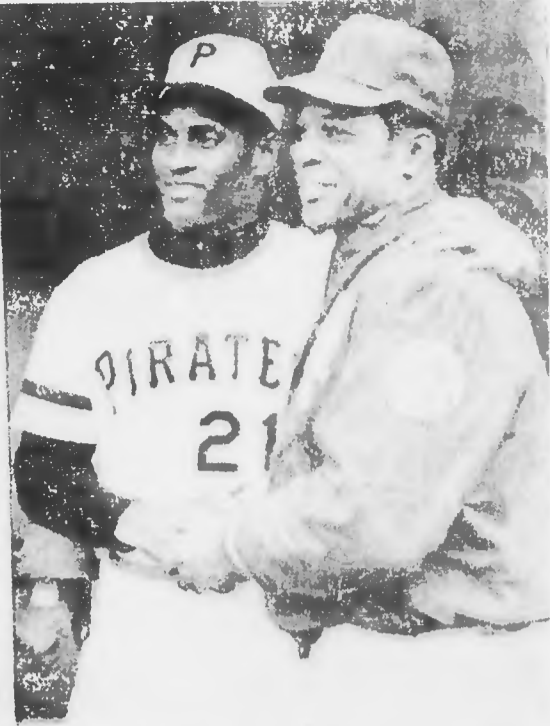
congratulates Clemente after he joined 3,000-club in October 2, 1972 photo from files. Clemente is reported to have been killed in the crash of a cargo plane en route to earthquake-stricken Nicaragua. The plane crashed shortly after takeoff from Puerto Rico late December 31. (UPI)