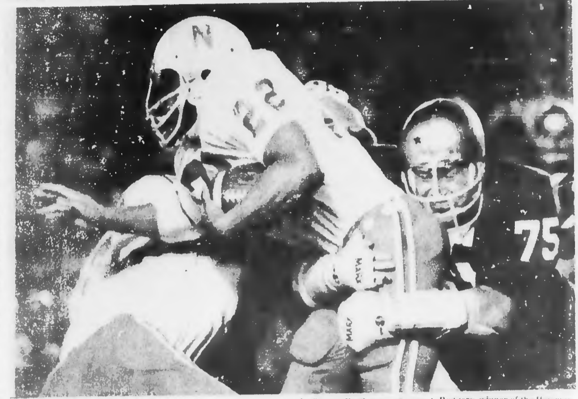
ROGERS GAINS - Miami - Notre Dame's Greg Marx (75) shows the strain of trying to stop Nebraska's Johnny Rogers (22) during