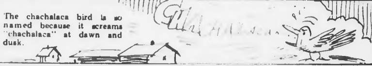
The chachalaca bird is so named because it screams "chachalaca" at dawn and dusk.