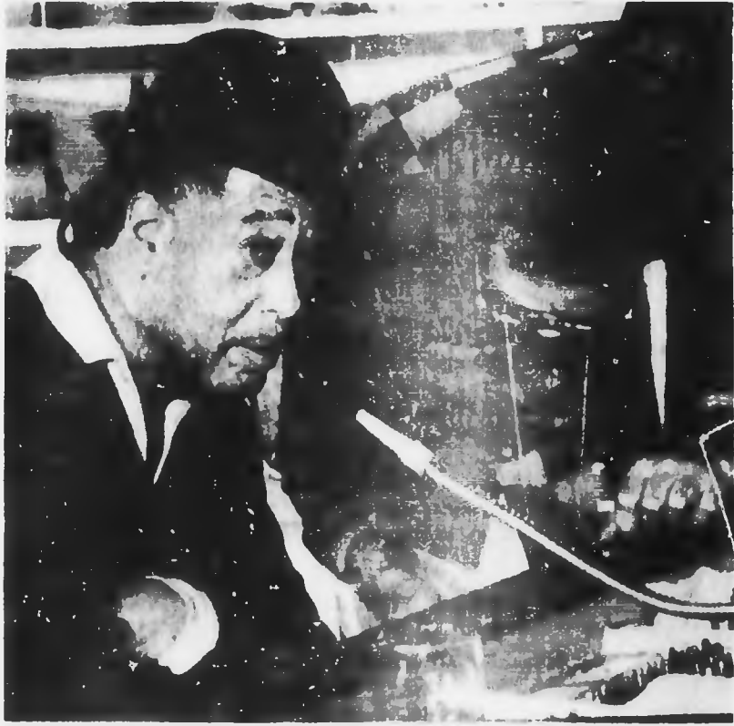
GET SET FOR ALL-STAR TRIBUTE - Los Angeles - A smiling Duke Ellington goes over program notes with producer Quincy Jones shortly before taping of an all-star tribute to the Duke. The show will feature top stars from the entertainment world plus government and society figures.