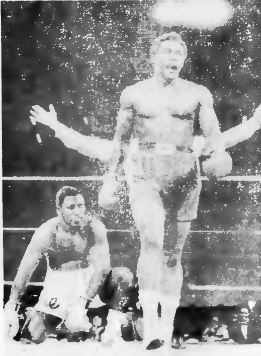
NEW CHAMP WALKS AWAY - Kingston, Jamaica - The referee stops the world heavyweight fight with his outstretched arms as challenger George Foreman walks across the ring from defeated Joe Frazier after the last knockdown.