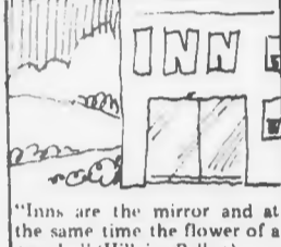
"Inns are the mirror and at the same time the flower of a people" (Hillaire Belloc)