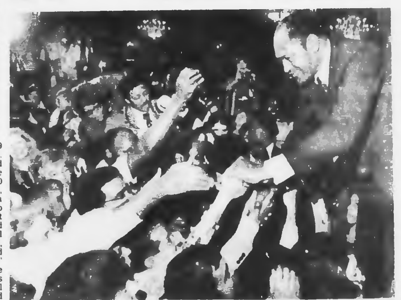
CITY COUNCILMAN LEADS MAYOR IN VOTES - Los Angeles, Calif. - Los Angeles City Councilman Tom Bradley, April 3, shakes hands with wellwishers as political history repeats itself and the city will have a runoff election between Bradley and Mayor Sam Yorty for post of Los Angeles Mayor. Bradley won more votes than Yorty as he did four years ago but neither got a majority and will meet in a special election May 29th.