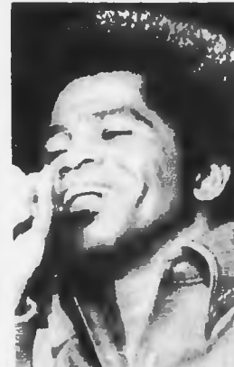
TALENT NOT RECOGNIZED: BROWN - Rio De Jeneiro "Soul Brother Number One." James Brown said Monday that he has not received recognition in the United States, even though he has sold more records than music's three Bs. "I have sold more than Bach, Beethoven and Brahms, put together, but because of the racial problem in the U.S., nobody emphasizes this," Brown declared.