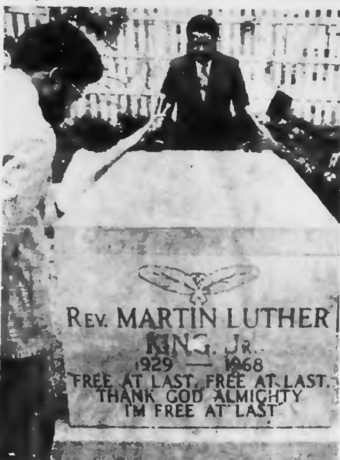
VISITS DR. KING'S TOMB AFTER QUITTING POST - Atlanta - Dr. Ralph David Abernathy (C) pauses for prayer at the tomb of his predecessor, Dr. Martin Luther King, Jr., after announcing his resignation as president of The Southern Christian Leadership Conference here July 9. Abernathy, who succeeded Dr. King 5 years ago when King was assassinated in Memphis, Tenn., said that he would step down formally at the SCLC's annual convention on August 16.