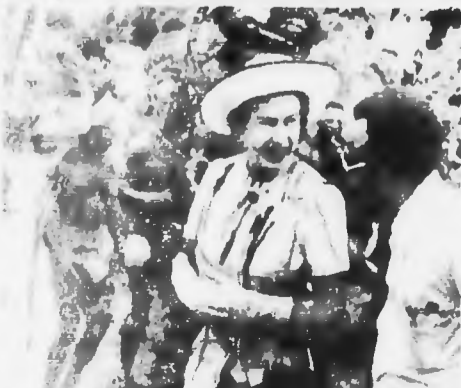
QUEEN CAN'T VOTE - London - Elizabeth II may be queen, but she can't vote for the man who will run her government. Queen Elizabeth, unlike the lowliest of her subjects, doesn't have the right to vote in the Feb. 28 national elections. Neither has any other member of the Royal Family. The queen is shown walking past native dancers on her arrival at Hubert Murray Stadium here Feb. 26.