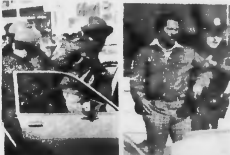
FIST-SWINGING MELEE ENDS IN ARRESTS - Oakland, Calif. - The "People In Need" project to which Randolph Hearst and the Hearst Foundation, already had contributed $2 million in return for his daughter's safety, got off to a chaotic start Feb. 22. At Oakland, there was a fist-swinging melee when a delivery truck drew up and someone threw food from it, leading to the brawl. Crowd (top) is unruly as police try to keep order. At bottom (L), one of the persons involved is taken into police car at (R) another, face bloodied, is taken in.