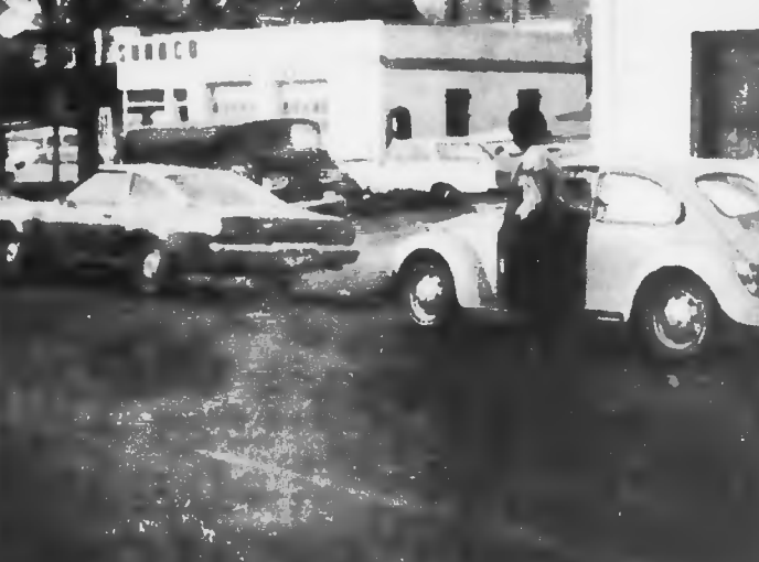
RALEIGH MOTORIST KEEPS ON PUSHING - This unidentified Raleigh driver of the economy Volkswagen automobile, apparently gave out of gas as he was parked in a line of cars leading to the Sunoco Service Station, located at the corners of E. Cabarrus and S. East Streets, so he began to push his vehicle toward his seeable destination last weekend. The gas lines in the Raleigh area had lessened this week, however.