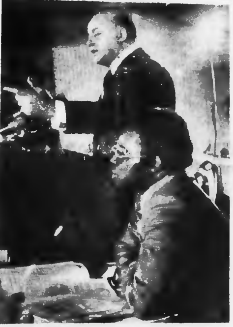
MAYORS DISCUSS ENERGY CRISIS - Washington - Mayor Joseph Alioto of San Francisco (standing) and Mayor Richard Hatcher of Gary, Ind. (seated), co-chairmen of the Legislative Action Committee of the U. S. Conference of Mayors, hold a news conference March 5. They discussed a mayors campaign to deal with the energy crisis and related problems.