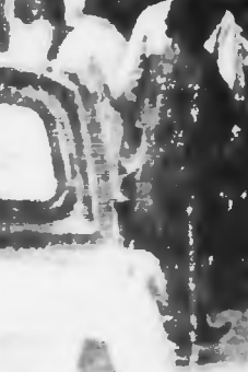
WAITING FOR FREE FOOD - San Francisco - People began lining up before dawn March 5 for the third distribution of free food which Randolph Hearst hopes will win his kidnapped daughter's freedom. This line was almost 250 strong at sunrise at San Francisco's Grove St. distribution center. The Hearst-sponsored "People in Need" program, set up at demand of the Symbionese Liberation Army, which kidnapped Patricia Hearst more than a month ago, said it expected to distribute about 35,000 bags of food.