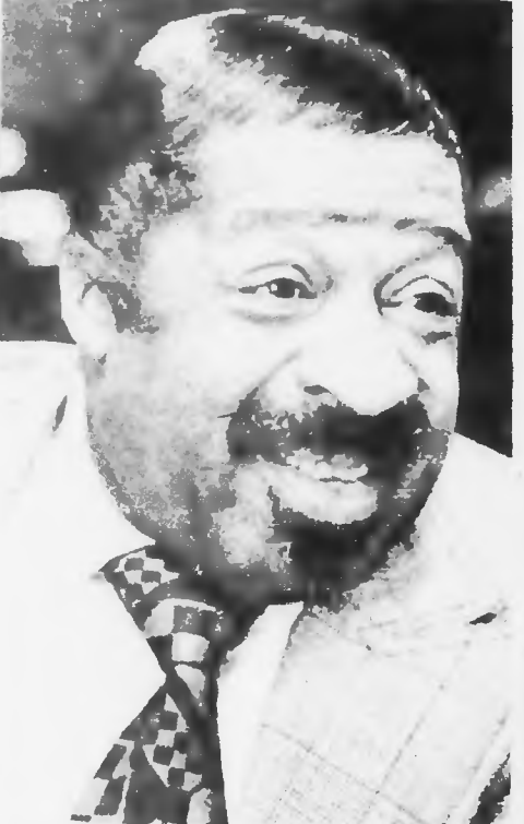
ERROLL GARNER REMINISCES ABOUT CAREER - Brussels - Winding up his 15th tour of Europe, pianist Erroll Garner, reminisces about his musical career. At age 53, he's one of the most sought-after musicians in the world. Unlike most pianists, Garner learned to play not by doing scales and sonatas, but by jamming on riverboats. He still can't read music.