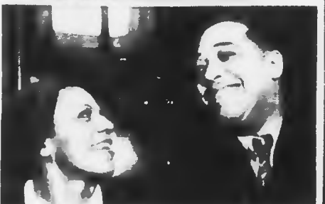
IN BYGONE DAYS - New York - Duke Ellington, the cool, impeccable composer who gave the world "Mood Indigo" and hundreds of other memorable compositions that made him one of the most influential bandleaders of the 20th century, died of lung cancer, complicated by pneumonia May 24 at the age of 75. Horn-totting Duke Ellington, he's shown (L) in 1973 photo and (R) with his wife in 1934 photo.