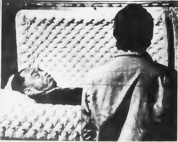
PRAYS AT ELLINGTON'S BIER - New York - A mourner kneels in prayer at the bier of Duke Ellington, giant of American jazz music, who died May 24 at the age of 75. The internationally famous composer and musician whose professional career exceeded half a century, was buried May 27.