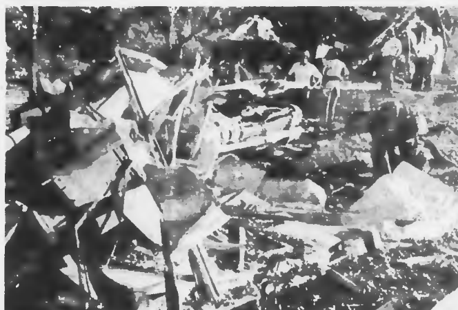
SEARCHES WRECKAGE OF HOME - Wenatchee, Wash. - Dave Gayle (R-plaid shirt) searches through wreckage of motor home (L) that he lived in Aug. 6 after railroad tank car exploded at rail yard. Two persons were killed and 60 injured. The tank car was carrying fertilizer of ammonium nitrate and anhydrous ammonia. The blast hurled debris over a mile and a half and left a crater 45 feet deep and 30 feet in diameter. Spectators in rear are looking at home that was destroyed in blast.