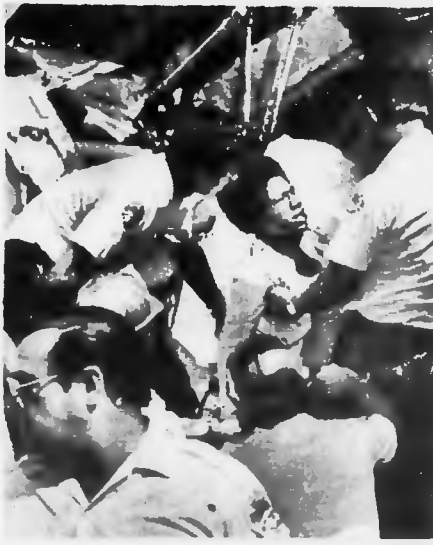
VICTIM OF BUILDING COLLAPSE RESCUED - Miami - Rescue workers lift a victim from the rubble after a downtown Miami building collapsed early Aug. 5, killing at least 4 persons and injuring at least 9 others. The building was being used by the drug enforcement agency and as an elevated parking deck.

Mrs. Irene W. Hunter of 310 N. Carver Street, saw her name under the advertisement paid for by Capital Mobile (See APPRECIATION, P. 2)