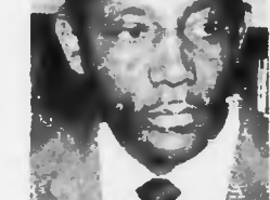
MAYOR EVERS CHARGED WITH TAX EVASION - Washington - A Federal indictment unsealed Aug. 13 in U.S. District Court in Jackson, Miss., charged Mayor Charles Evers, of Fayette, Miss., with evading more than $50,000 in federal income taxes, the Justice Department announced here. Evers is the brother of slain civil rights leader Medgar Evers.