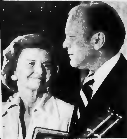
NEW PRESIDENT OF THE UNITED STATES, FIRST LADY - Washington - With tears glistening in her eyes, Betty Ford looks up in admiration at her husband, Gerald, the new President of the United States of America Aug. 9. Mrs. Ford is holding the Holy Bible on which Pres. Ford swore his oath. He has his arm around her shoulder.