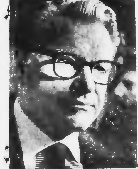
NEW VICE PRESIDENT-DESIGNATE - Washington - President Ford announced Aug. 20 that he has named former New York Governor Nelson Rockefeller as his choice for Vice President of the United States.