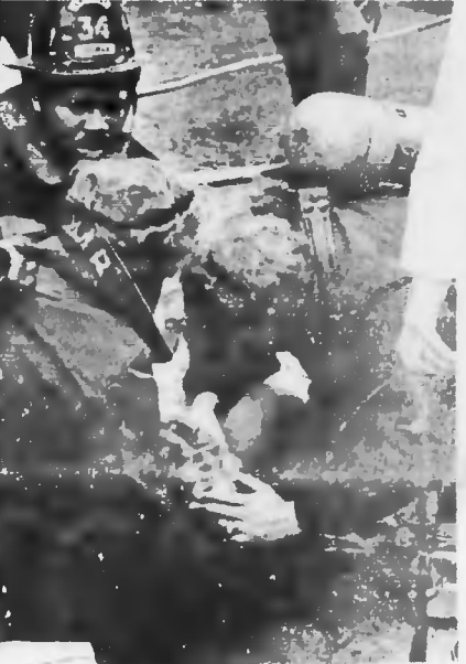
INMATE TREATED FOR INHALATION - Charlottesville, Va. - Charlottesville firefighters treat an inmate of the Charlottesville City Jail for smoke inhalation after a fire broke out about 1 p.m. Aug. 19 at the jail when one of the inmates set his mattress on fire. The inmate was one of two overcome by smoke. Both were treated at the University of Virginia Hospital and released.