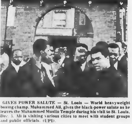
GIVES POWER SALUTE — St. Louis — World heavyweight boxing champ, Muhammad Ali, gives the black-power salute as he leaves the Muhammad Muslim Temple during his visit to St. Louis, Dec. 5. Ali is visiting various cities to meet with student groups and public officials.

Dr. Muhammad Ali is visiting various cities to meet with student groups and public officials.