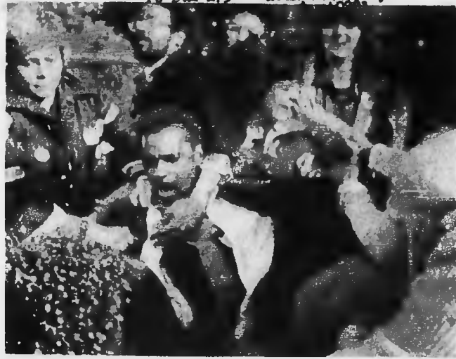
TARGET OF FEMINIST MARSHALLS — Atlanta — A young man is wrestled to the ground by feminist marshalls during an ERA demonstration in front of the Georgia State Capitol, Jan. 10. The man was shouting religious warning to the demonstrators. No one was injured in the incident.