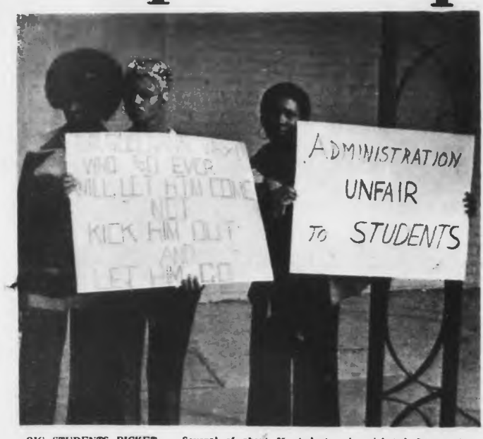
STUDENTS PICKET — Several of about 25 students who picketed Opportunities risilization Center (OIC) on East Martin 8t. Monday and Tuesday. Sometimes the protestors stood. At other times they chanted and marchet.