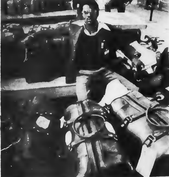
FOREIGN BLACKS WITHDRAW FROM OLYMPICS — Montreal — Unidentified Ethiopian athlete sits amid a pile of Ethiopian team luggage at Olympic Village, as the Ethiopians, who had earlier announced their withdrawal from the Olympic Games, left for home July 20.