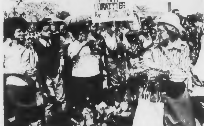
STREET NAMED TO HONOR MRS. PARKS — Detroit — Mrs. Rosa Parks (R) greets well-wishers as she arrives at the dedication ceremony for the renaming of a street in Detroit in her honor. Mrs. Parks was brought to national attention in 1955 when she refused to give up her seat on a bus to a white man in Montgomery, Ala. This action gained her the title "Mother of the Civil Rights Movement." She moved to Detroit in 1957 after numerous threats.