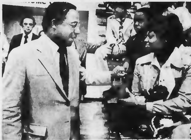
HALEY GREETSS NCCU SPECTATORS — Durham, N.C. — Author Alex Haley greeting spectators prior to a speech given at North Carolina Central University April 22. Haley was scheduled Friday for allegedly copying from a novel large parts of the American portion of his best selling work, Roots.