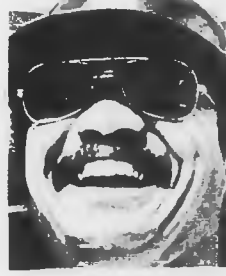
PICTURE OF CONFIDENCE — NEW YORK: Yankee cleanup hitter Reggie Jackson is without a doubt the picture of confidence Oct. 5 of the American League championship playoffs against the Kansas City Royals. Perhaps Reggie hadn't yet gotten the news that he was being hit by a $2 million lawsuit for allegedly kicking a 13-year-old boy following the All-Star game at Yankee Stadium.

HENDERSON — Two young black men were arrested here Tuesday afternoon in the kidnaping of a brother and sister from their home on Orange Street, transporting them to Virginia, and finally murdering the sister after the pair refused to divulge the combination of a safe last Tuesday night.