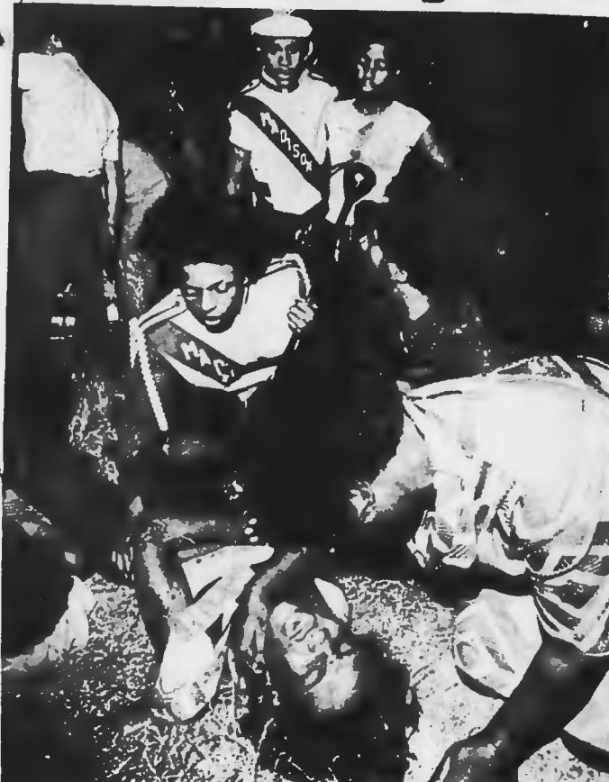
COMFORTS INJURED STUDENT — Dallas — Three teenagers were killed and at least a dozen more were injured when their pickup truck slammed into an overpass abutment on an expressway near downtown Dallas late Sept. 30. The dead and injured were members of a high school band returning home after a football game. Here one of the injured is comforted by friends.