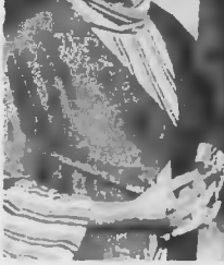
ONE OF TEN MOST OUTSTANDING VISITS