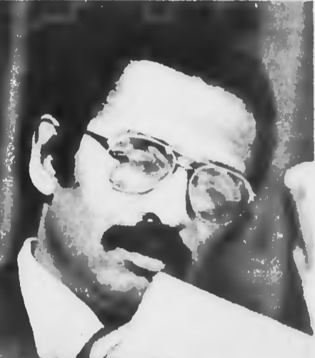
A PARTICIPANT — Rep. John Conyers (D-Mich.) will be one of several participants in the Blacks and Criminal Justice Conference which begins at Shaw University Thursday afternoon.