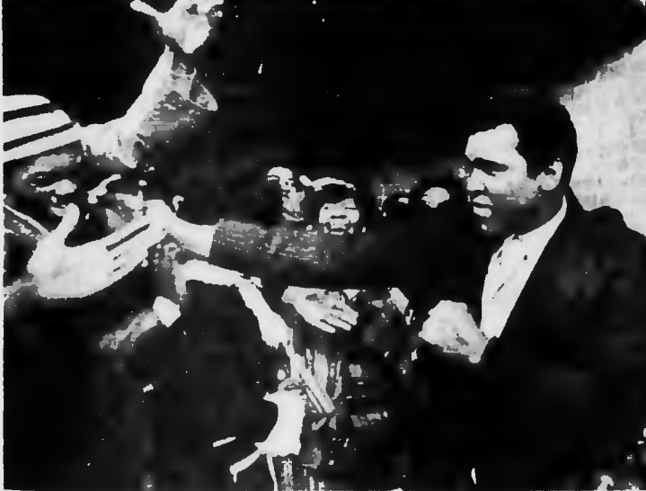
MUHAMMAD ALI APPEARS IN DURHAM — Durham, N.C. — World heavyweight champ Muhammad Ali does some friendly sparring with enthusiastic fans after addressing faculty and students at Durham College Dec. 6 where a new health and physical education building was dedicated and named in his honor.