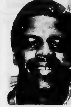
NAMED PLAYER OF THE YEAR — New York — Earl Campbell, unbeaten Texas University's running back, was honored Dec. 6 as the United Press International's College Football Player of the Year. Campbell is a strong candidate for the Heisman Trophy to be announced Dec. 8.