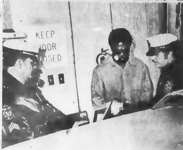
HEAVYWEIGHT CONTENDER BOOKED FOR MURDER — Golden, Colo. — Heavyweight boxer Ron Lyle (C) is escorted back to police car after he was arraigned on second degree murder charges in Golden District Court here Jan. 2. Lyle, ranked third in the World Boxing Association ratings, is charged with second degree murder in the shooting death of his former trainer. Officers are unidentified.