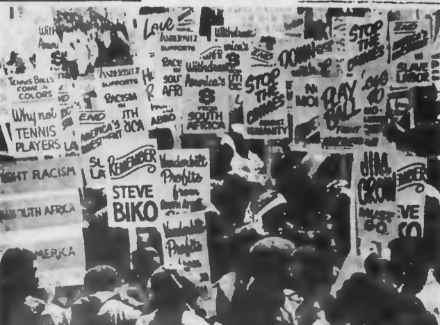
MASSIVE PROTEST STAGED — Nashville, Tenn. — Several thousand sign waving demonstrators gathered on the plaza at Tennessee's State Capitol March 18 for the start of a protest against African racism and the Davis Cup tennis matches between the U.S. and South Africa.

Three names are listed on this week's Appreciation Money Page. It is on the back of the front section.