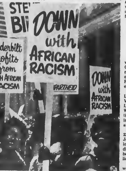
PROTEST AFRICAN RACISM — Nashville, Tenn. — Brandishing signs protesting African racism, several thousand demonstrators gathered at Tennessee's State Capitol last week to protest the Davis Cup Tennis Tournament which was underway here.

Three names are listed each week in advertisements on the Appreciation Money Page. The page is on the back of the front section. Readers who find their names should report to The CAROLINIAN before noon Monday.