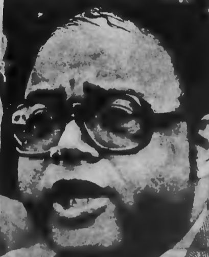
PLEADS 'NOT GUILTY' TO KICKBACK RAPS — Washington — Rep. Charles Diggs, D-Mich., talks to reporters outside U.S. District Court April 7 where he pleaded "not guilty" during his arraignment on federal payroll kickback charges. Diggs told reporters he was innocent of wrongdoing and expects to be vindicated by his trial.