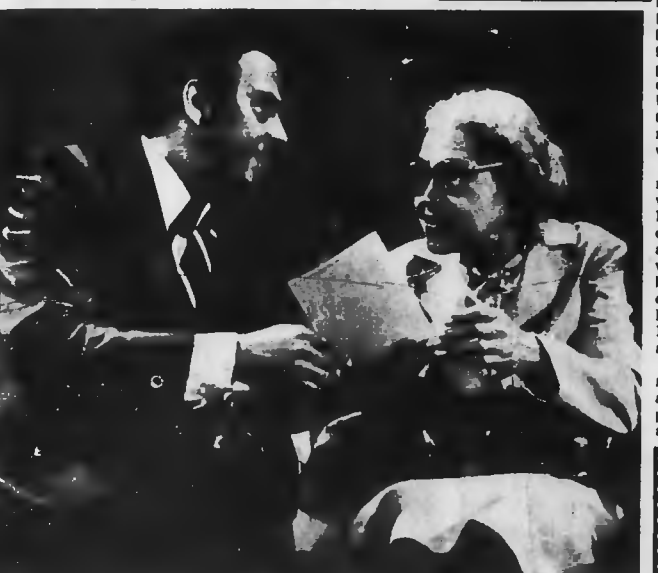
LOOK OF ADMIRATION — Los Angeles — United Nations Ambassador Andrew Young looks at Mrs. Rosa Parks during proceedings at the Progressive Baptist Convention Aug. 11. Mrs. Parks was given an award for her part in an incident in Dec. 1955 in Montgomery, Ala., when she was arrested for refusing to give up her bus seat to a white man.

Rev. Dr. Joseph Lowery, SCLC president, in announcing (See AMB. YOUNG , P. 2)