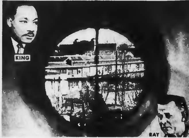
PROBE OF DR. KING'S DEATH MOVES TO CAPITOL — Washington — James Earl Ray, the small-time crook who assassinated Dr. Martin Luther King, Jr., was the center of attention Aug. 16 on a security-ringed Capitol Hill. View is of Loraine Hotel in Memphis, through simulated telescopic gunsight. Arrow indicates approximate spot where King was standing when he was shot.

The competency test was authorized by the N.C. General Assembly in 1977, and will be given to 11th graders statewide in November of 1978. Students (See BOYCOTT , P. 2)