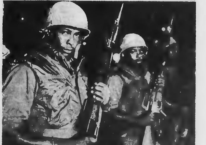
NATIONAL GUARDSMEN READY FOR ACTION — Memphis, Tenn. — Heavily armed National Guardsmen take up positions at the gate to the West Police Precinct as they protected non-striking policemen as they arrested over 40 of their fellow striking officers early Aug. 14.