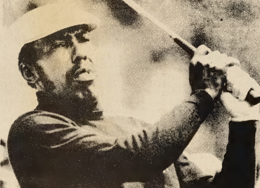
BITING THE TEE —Augusta, Ga.—Calvin Peete grips a tee in his teeth and hits off the fourth hole in the par-three event April 11 prior to the first round of the 1984 Masters Thursday, April 12.