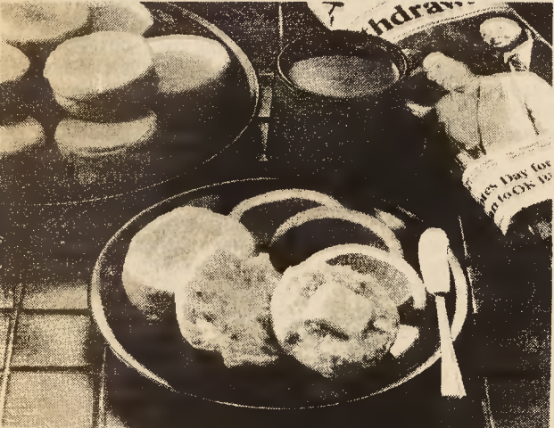
ENGLISH MINI-MUFFINS (Makes about 2 1/2 dozen)

Surprise the family with homemade English Mini-Muffins. They're easier to prepare because you use your mixer dough hooks for the kneading process. Evaporated milk gives them a tender crumb and super texture. Try them. They're fun.