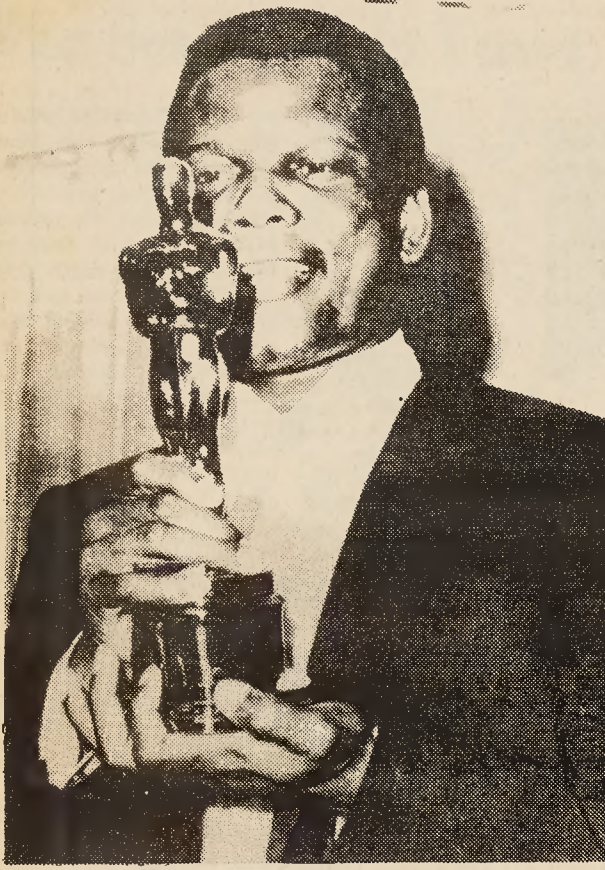
POITIER BECOMES A FIRST —Santa Monica, Calif.—Sidney Poitier holds his award April 13, 1964 after becoming the first black man to win a motion picture "Oscar" as best actor. He was honored for his role in "Lilies of the Field."