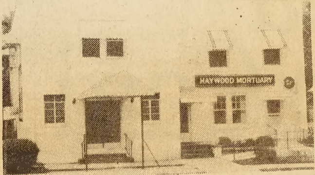
"Serving Raleigh-Wake County-Surrounding Counties for Over 65 Years"