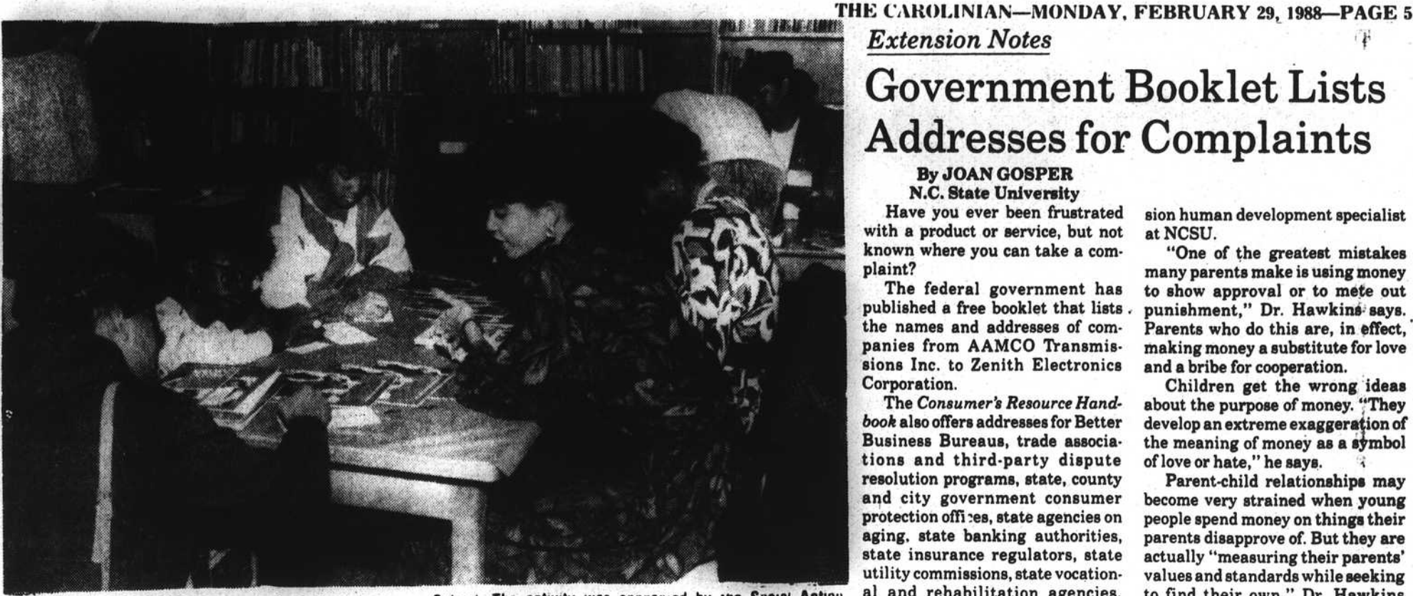
middle and high school level participants explored prograofferings at historically black colleges and universities duries

Harvard College, made up of Harvard University's undergraduate in-