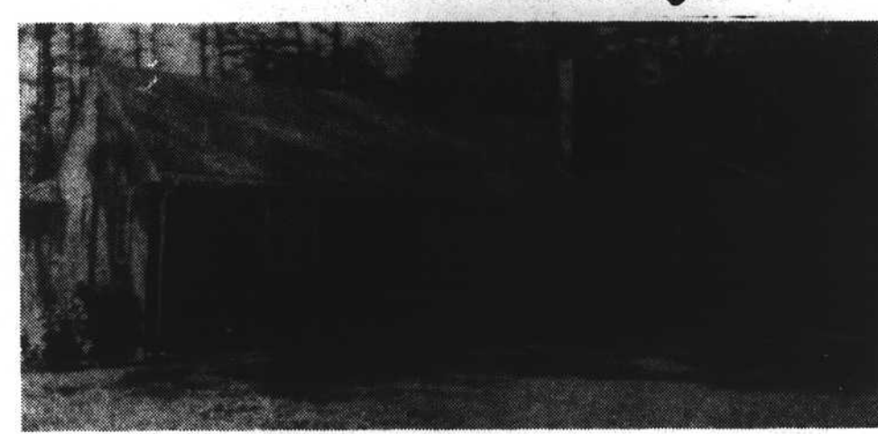
2320 NEW BERN AVE.—3 B/R, 2 Baths, Dbl. Garage. $110,000

108 BAINBRIDGE CR.—3 B/R, 2 Baths, Dbl. Garage. $73,900 2505 BANEY CT.—3 B/R, Quite Qui-de-Sac. $53,500 1312 BEVERLY DR.—3 B/R, WORTHDALE. $53,500 312 GOLF COURSE DR.—3 B/R, 2 Baths, LONGVIEW GARDENS. $92,000 1405 GRIFFIN CIRCLE—5 B/R, 2.5 Baths, WISE BUY. $89,900 301 LORD ASHLEY RD.—4 B/R, 2 Baths, Appx. 2,000 Ft. $74,900 401 PIN OAK ROAD—4 B/R, 2 Baths, Garage. $89,900 2112 RAMSEUR ST.—3 B/R, CORNER LOT. $51,900