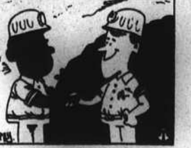
Economic development, not destruction, is seen as the way to promote equality for Black South Africans.